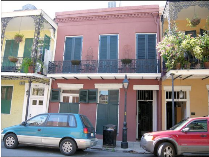
1125 Royal St., Unit 4., New Orleans, LA